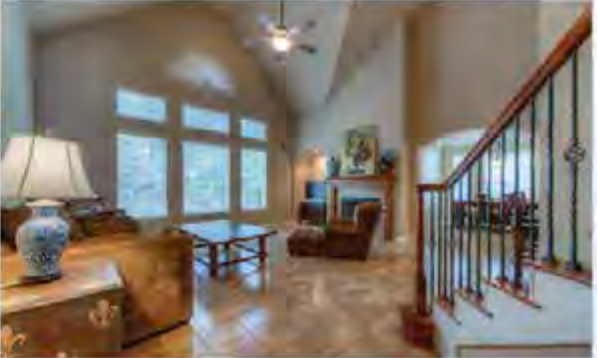
709 ARROWHEAD TRAIL SOLD OVER ASKING PRICE $419,000

Experience and market knowledge make a big difference when selling your home. What will your agent do to sell your home?