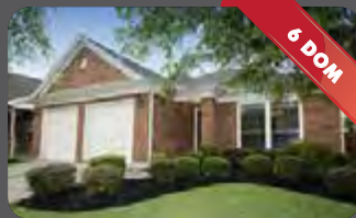
SOLD 13112 CASTLEWIND LN. 6 DAYS ON THE MARKET 4/2/2 1 STORY HOME