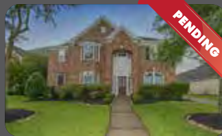
SOLD 2506 QUIET LAKE CT 4/3.5/2 $299,995