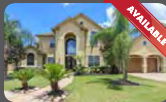
AVAILABLE 2225 LONG COVE COURT 5 BED / 3.5 BATH / 3 CAR GARAGE POOL / $599,900