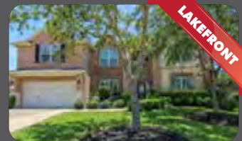
SOLD 2301 BENDING SPRING DR. 4 BED / 3.5 BATH / 2 CAR GARAGE