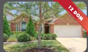
SOLD 2911 EMERALD BROOK LN 3 BED / 2 BATH / 2 CAR GARAGE $199,999