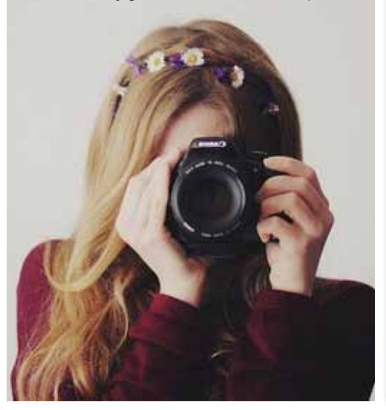
Photo credit and prize given to photo chosen as feature on the new home page. Deadline for entries: February 15th.