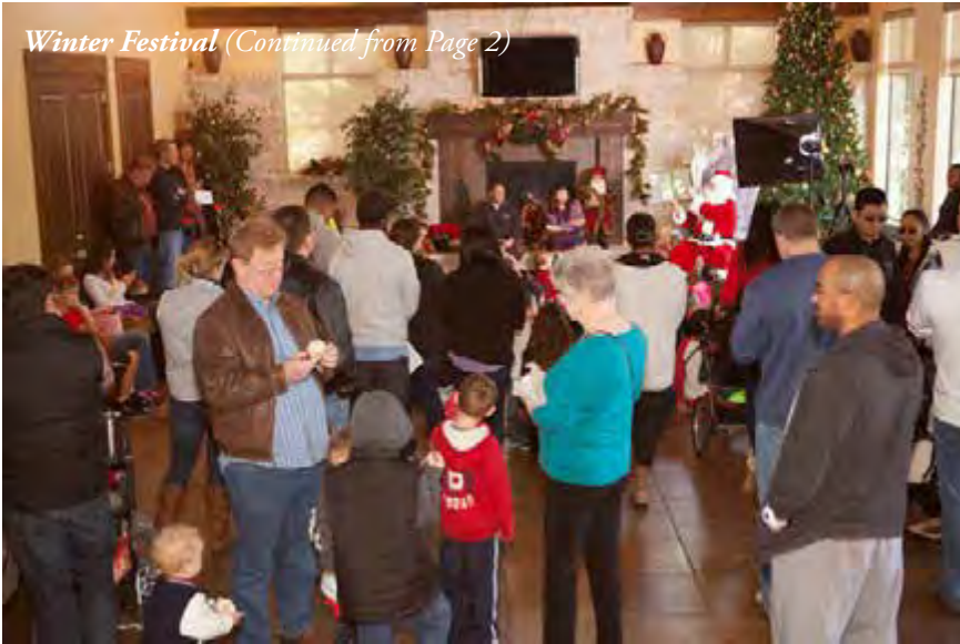
Winter Festival (Continued from Page 2)