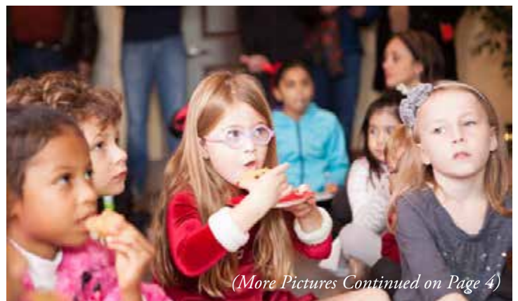
(More Pictures Continued on Page 4)