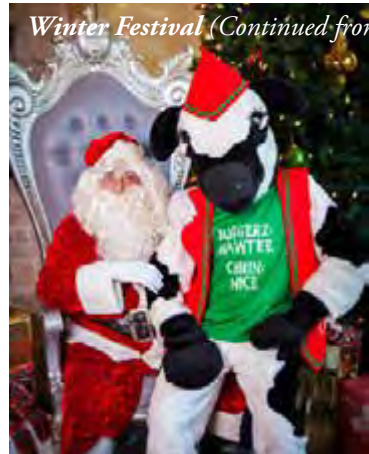
Winter Festival (Continued from Cover)

Peel, Inc. ....www.PEELinc.com Advertising.....advertising@PEELinc.com, 888-687-6444