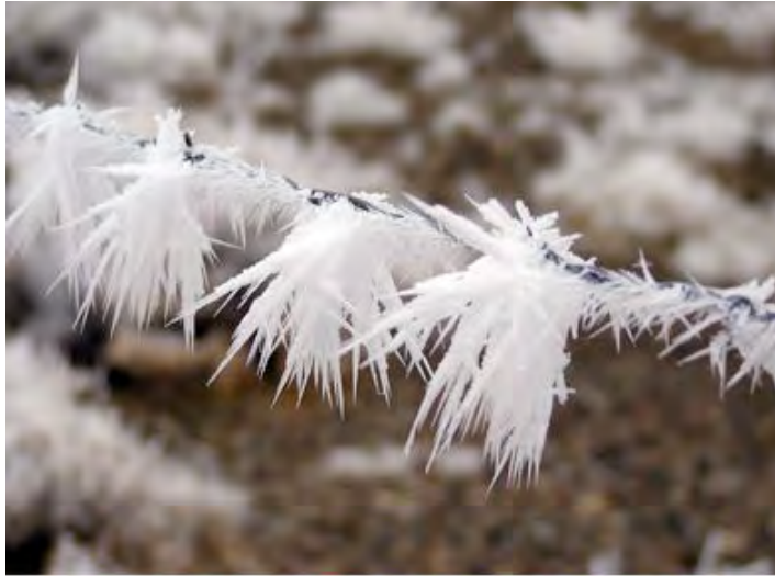
Hoar frost on barbed wire

Send your nature-related questions to naturewatch@austin.rr.com and we'll do our best to answer them. Check out our book, Nature Watch Austin , published by Texas A&M University Press, and our blog at naturewatchaustin.blogspot.com if you enjoy reading these articles!