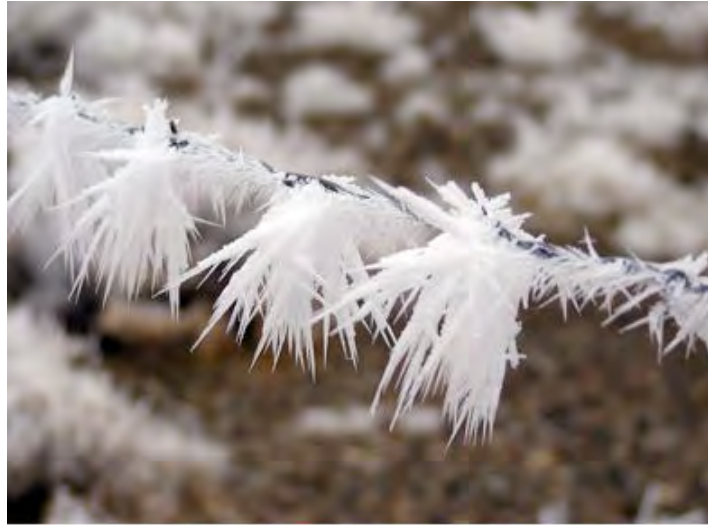
Hoar frost on barbed wire

Send your nature-related questions to naturewatch@austin.rr.com and we'll do our best to answer them. Check out our book, Nature Watch Austin , published by Texas A&M University Press, and our blog at naturewatchaustin.blogspot.com if you enjoy reading these articles!