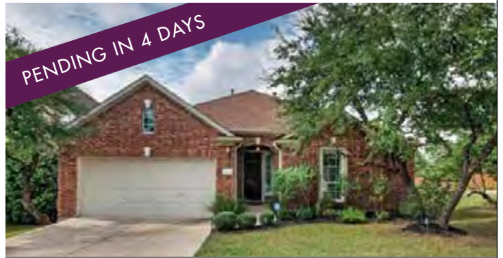
8500 ALOPHIA DRIVE