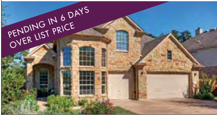
12317 ALCANZA DRIVE