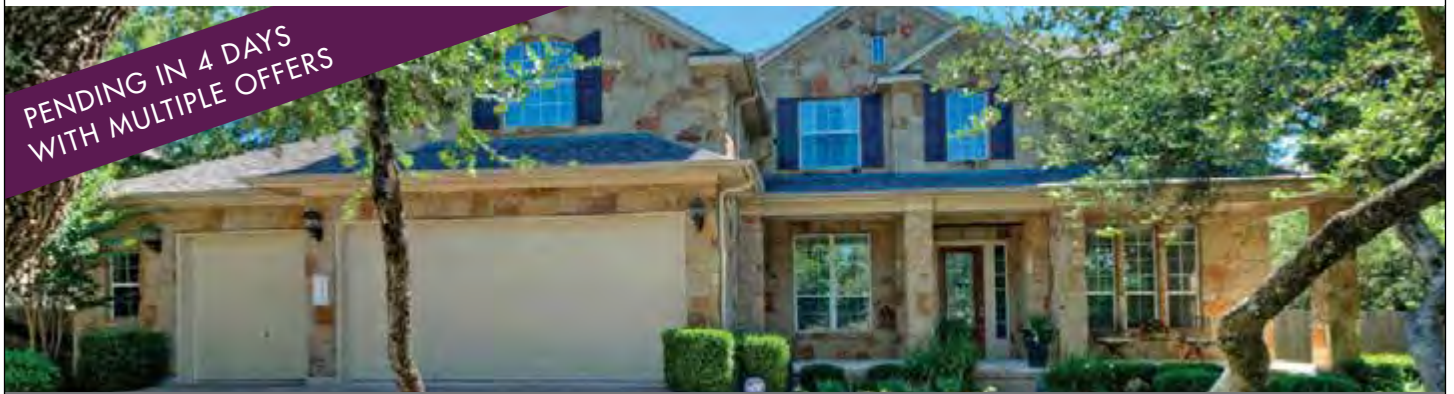
12316 ALCANZA DRIVE

ASHLEY STUCKI HAS THE SYSTEMS AND SPECIALIZED SUPPORT IN PLACE TO ENSURE AN EFFICIENT, SUCCESSFUL, AND STRESS-FREE TRANSACTION: