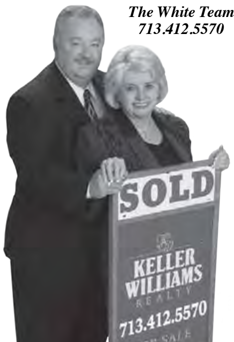
The White Team 713.412.5570