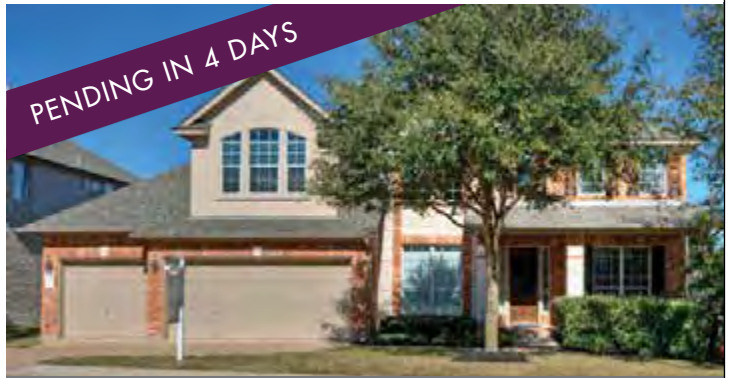
7416 MITRA DRIVE