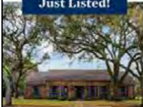
5310 Braesheather Drive Offered at lot value $495,000 ±15,510 square foot lot