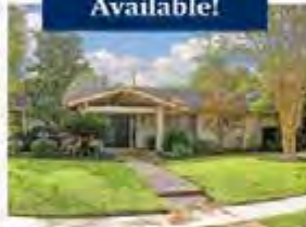
5003 Heatherglen Drive Offered at $449,500 4 BEDROOMS | 3.5 BATHS