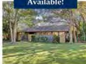
5103 Grape Street Offered at $589,500 3 BEDROOMS | 2 BATHS