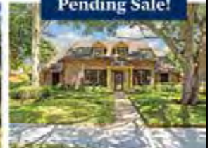
9607 Moonlight Drive Offered at $575,000 4-5 BEDROOMS | 0 BATHS

Contact us with all your real estate needs.