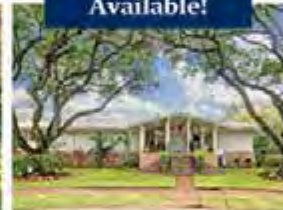
9402 Braesheather Offered at $975,000 4 BEDROOMS | 3.5 BATHS