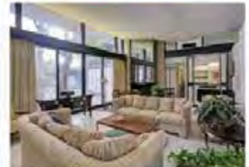
5111 Contour Place Last list price $650,000 4-5 BEDROOMS | 3.5 BATHS