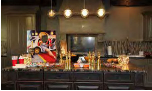
Extreme Teen Night celebrates the Oscars