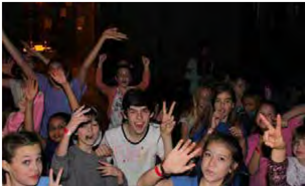
Gift Cards handed out for those who won the Freeze Dance CompetitionCha Slide