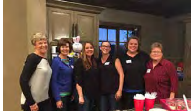
Book Club members enjoy chatting about the latest book selection over homemade treats and coffee.