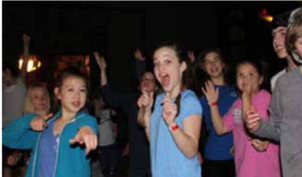
Sweetwater Teens dance the night away to the Cha