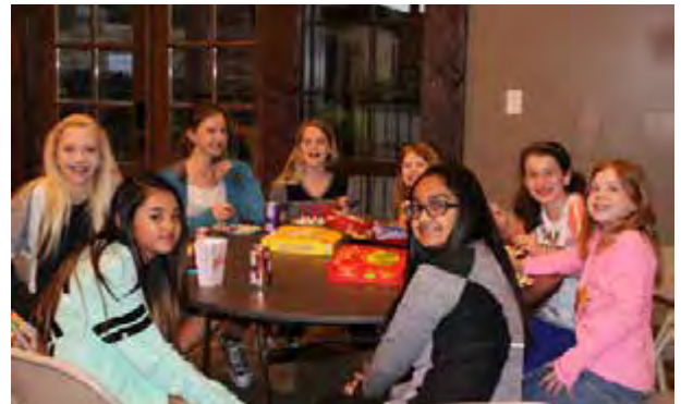
Teens munch on popcorn and treats while enjoying their friends' company.