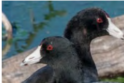
American Coots are commonly called 'Mud Hens'.

An overall blackish, plump, chicken-like bird with a rounded head, red eyes, a sloping whitish bill with a dark band near the tip, and a small reddish brown forehead shield, coots swim like ducks but do not have webbed feet