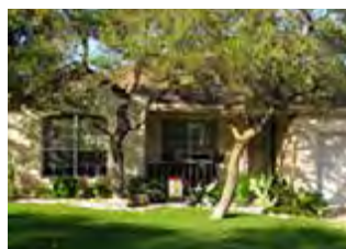
Sold at 103%