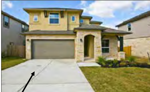
6716 Vitruvius Drive~ John's buyer~ "UNDER CONTRACT!" Brand new Standard Pacific home with over $40,000. in upgrades added for sale! Listed at $469,000. In Circle C Avana!