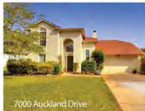
7000 Auckland Drive