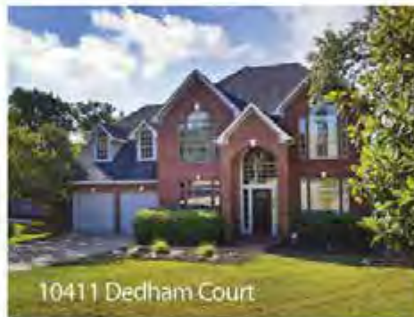
10411 Dedham Court