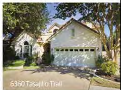
6360 Tasajillo Trail