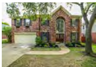
Sold Pre-MLS, 103%