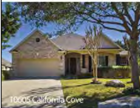
10605 California Cove