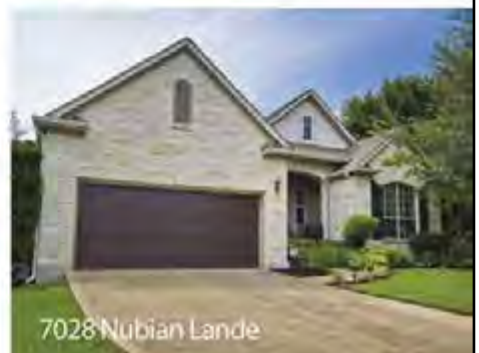
7028 Nubian Lande