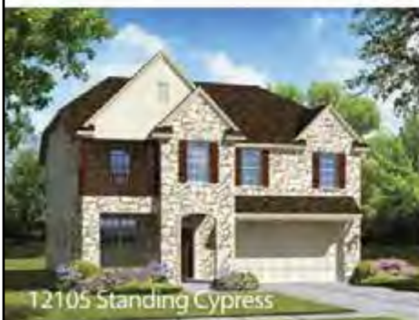
12105 Standing Cypress