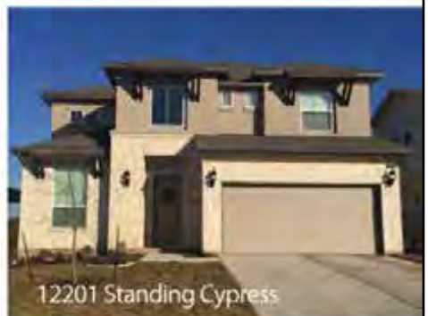
12201 Standing Cypress