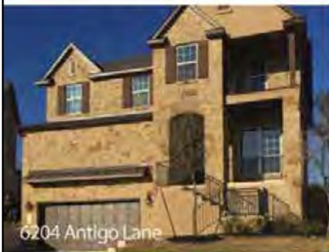
6204 Antigo Lane