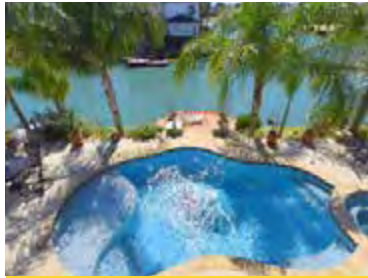
Sydney Harbour Lake View

5/3.1/2 with Gorgeous Pool Picky Buyers Welcome