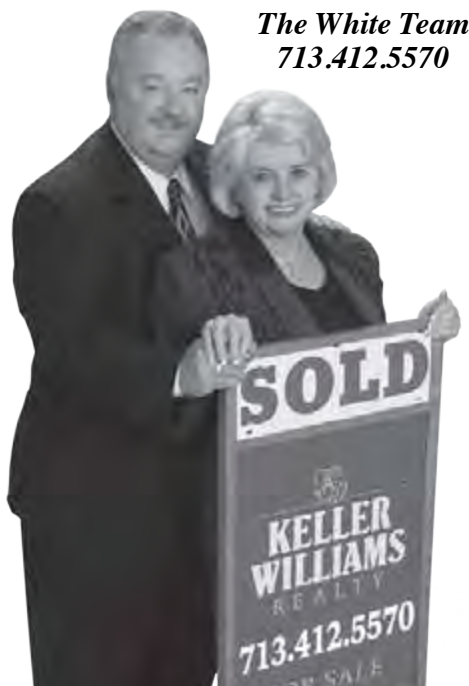
The White Team 713.412.5570