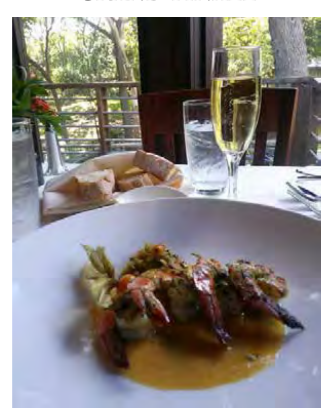
Tuesday, May 17, 2016 11:30am AT RAINBOW LODGE 2011 Ella Boulevard

Copyright © 2016 Peel, Inc. Woodwind Lakes - May 2016 1