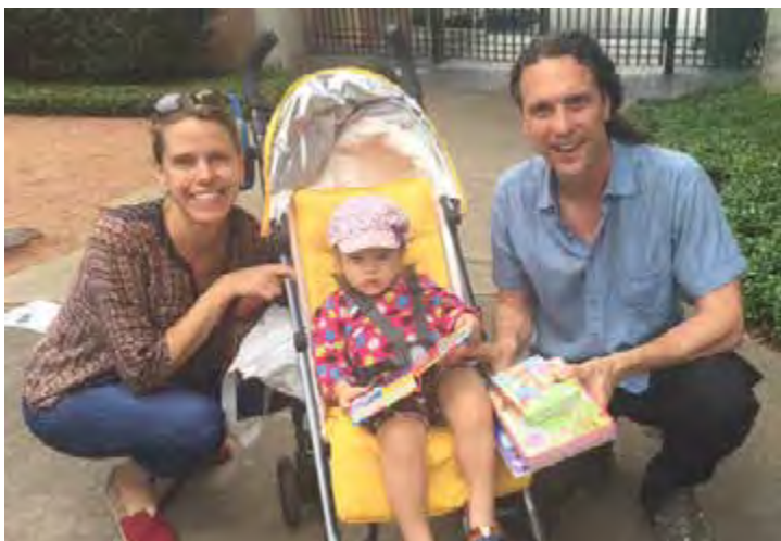
Toy Swap (Continued from Cover)

All news must be received by the 12th of the month prior to the issue.