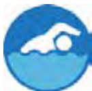
LEARN TO SWIM