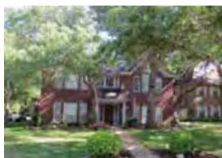
Sold, Multiple Offers, 103%