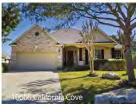
10605 California Cove