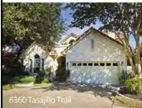
6360 Tasajillo Trail