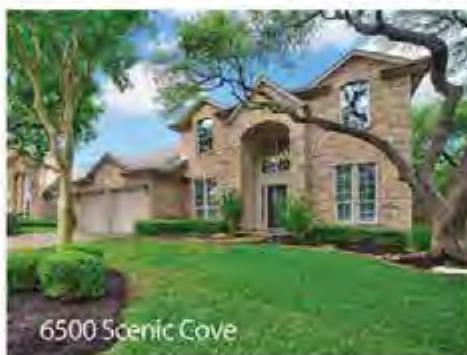
6500 Scenic Cove