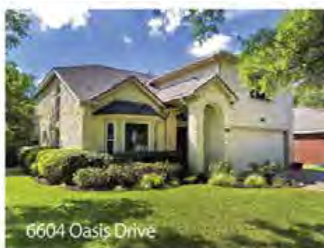
6604 Oasis Drive