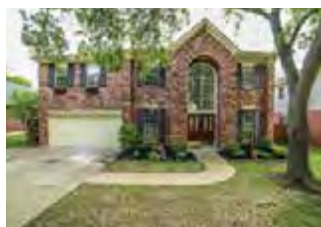
Sold Pre-MLS, 103%