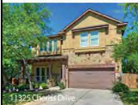
11325 Cheryl Drive