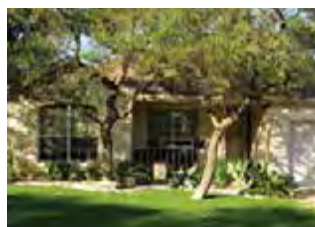
Sold at 103%