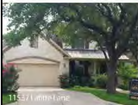
11537 Lafitte Lane