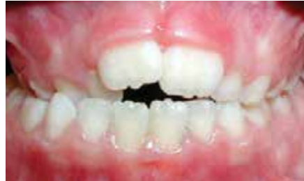
Crossbite of Back Teeth

Top teeth are to the inside of bottom teeth