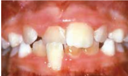
Crossbite of Front Teeth

Malocclusions (“bad bites”) like those illustrated below, may benefit from early diagnosis and referral to an orthodontic specialist for a full evaluation.