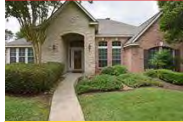
Lakes of Rosehill

Oh So Pretty 1-story, 4-bedroom, 3-car on Oversized Lot