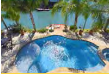
Sydney Harbour Lake View

5/3.1/2 with Gorgeous Pool Picky Buyers Welcome