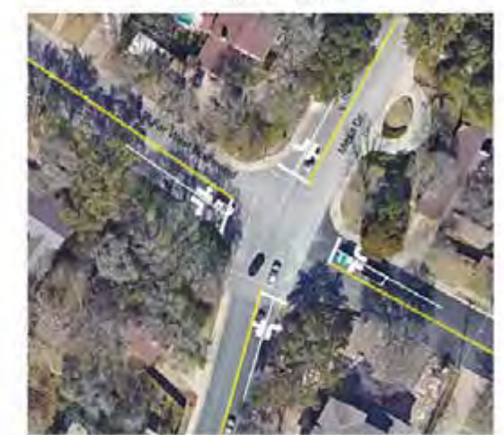
Austin Transportation Department

Mesa Drive and Far West Boulevard Stetch of Proposed Lare Designation