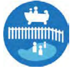
KEEP YOUR HOME SAFER