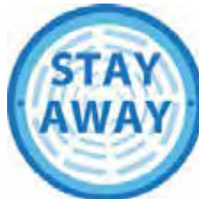
PRACTICE DRAIN SAFETY