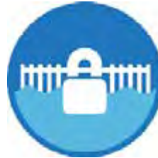
MULTIPLE BARRIERS AROUND WATER