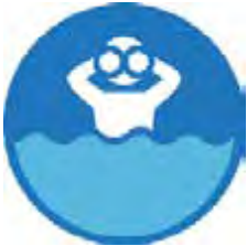
WATCH KIDS & KEEP IN ARM'S REACH