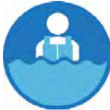
WEAR LIFE JACKETS