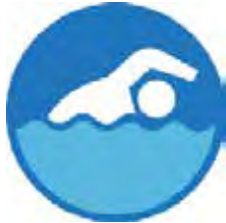
LEARN TO SWIM