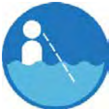
CHECK WATER SOURCES FIRST