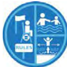
BE SAFER IN OPEN WATER