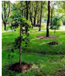
Sheri Merola – Crepe Myrtle(Pink) Limoncello Yellow Roses - section #2