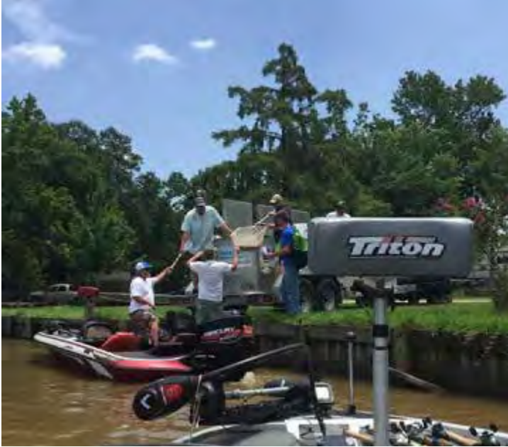
Volunteers lining up their boats to fill live wells with the 80,000 bass fingerlings.

Atascocita residents enjoy the beauty of Lake Houston every day as we drive through our neighborhoods, cross the bridges to Kingwood or Huffman, or visit one of our neighborhood parks that are part of this lovely community. Some of us may boat, ski or kayak around the many inlets and islands on the lake. Water has such a way of bringing a peace to our souls and a calm to our often times, busy lives. Even if for just a few minutes, we gain a different perspective by relaxing near or on the lake.