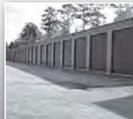
BOAT / RV STORAGE