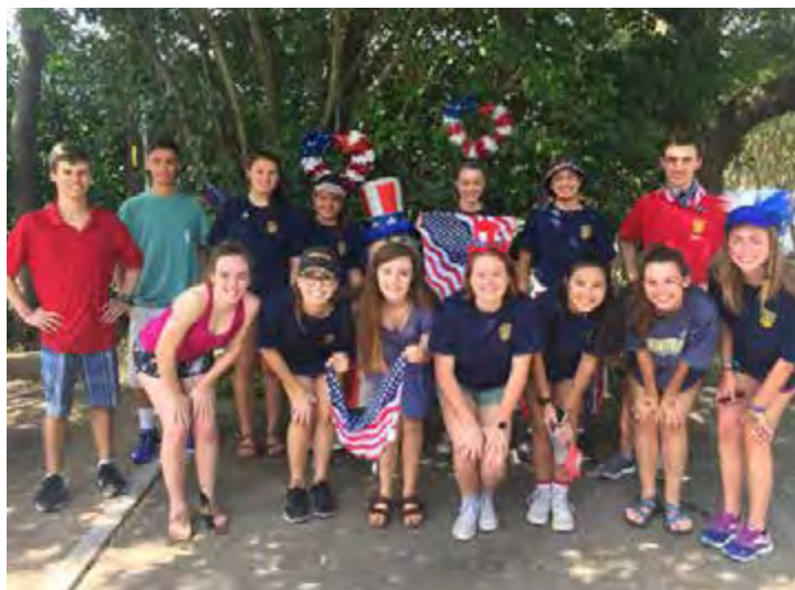
July 4th Celebration (Continued from Cover)

All news must be received by the 12th of the month prior to the issue.