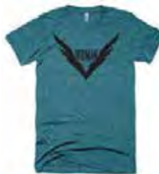
Birdman Custom Tee