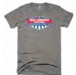
Hill Country Indoor Custom Tee

We offer custom apparel of all kinds including one-offs for any occasion.