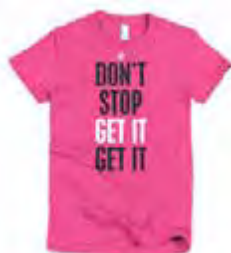
Don't Stop Get it Get it Women's Tee