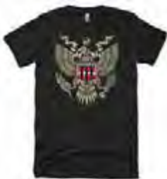
Great Seal of United States Tee