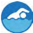
LEARN TO SWIM