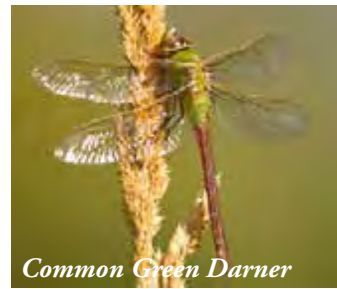
Common Green Darner