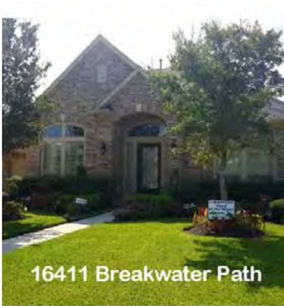
16411 Breakwater Path