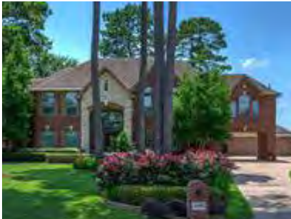
Lakes of Rosehill's Best