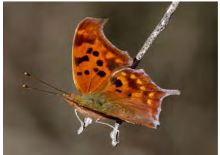
Top: Question Mark Bottom: Common Buckeye

Send your nature-related questions to naturewatch@austin.rr.com and we'll do our best to answer them. If you enjoy reading these articles, check out our book, Nature Watch Austin (published by Texas A&M University Press), and our blog at naturewatchaustin.blogspot.com .