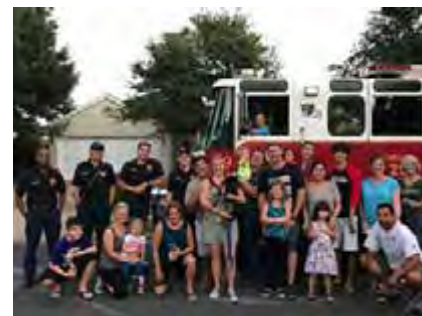
The Whiteworth Loop gang with AFD Engine 29.