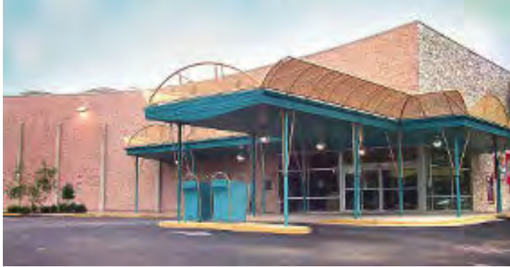
January and February 2017 Yarborough Branch Library

The Highland Park West Balcones Area Neighborhood Association Board of Directors will meet for its January 9, 2017 and February 6, 2017 monthly meetings at the Yarborough Branch Library, 2200 Hancock Drive. The Yarborough Branch Library will be closed for renovations from March through November 2017 necessitating a change in meeting location for the remainder of 2017.