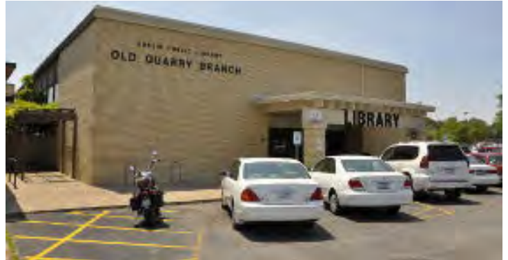
March-November 2017 Old Quarry Branch Library

The HPWBANA Board will transition to the Old Quarry Branch Library, 7051 Village Center Drive (near the HEB), for the monthly meetings for the balance of the 2017 year. Meetings at the Old Quarry Branch Library are scheduled for the evenings of March 6, April 3, May 1, June 5, August 7, September 11, October 2, and November 6. There will not be monthly meetings in July or December 2017.