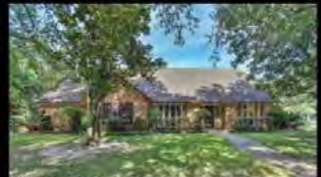
Over 4,600 square feet. Master down. Approved for elevation grant. $435,000