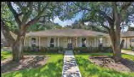
Recent renovations in pretty Meyerland area. 3/2. Spacious Backyard. $354,900