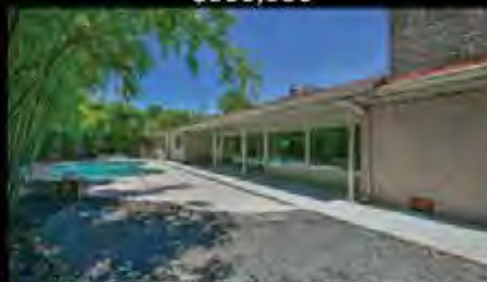
Massive 5/4.5 with pool. Mid-century on a cul de sac. $549,000