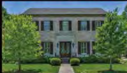
Custom 5/4.5 with Master down. Gameroom. Reduced to $999,950