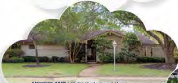
MEYERLAND | 9607 Cedarhurst Drive

Offered at $499,000 | 3 BEDROOMS | 2 BATHS Extensively remodeled with pool