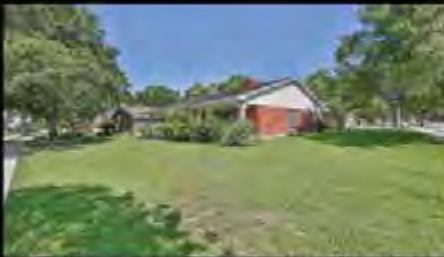
9,000 + sqft corner home site near Godwin Park and new construction. $347,900

LET US ADD VALUE TO YOUR NEXT REAL ESTATE TRANSACTION!