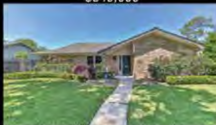
Renovated 4/2 with neutral colors and architectural interest. $599,000