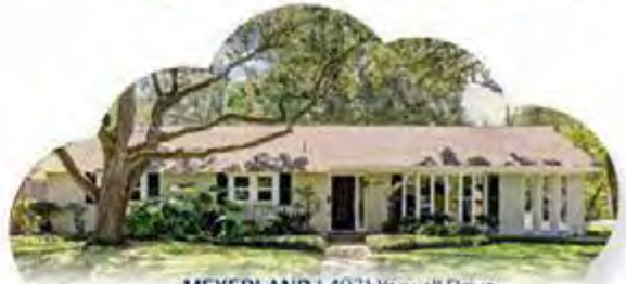
MEYERLAND | 4971 Yarwell Drive

Offered at lot value $385,000 | ±3,263 SQ. FT. | ±11,570 SQ. FT. LOT