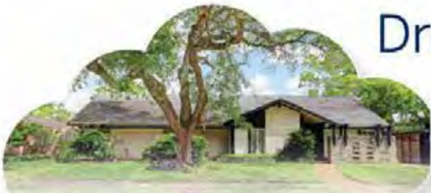
MEYERLAND | 5114 Braesheather Drive

Offered at lot value $385,000 | ±3,263 SQ. FT. | ±11,570 SQ. FT. LOT