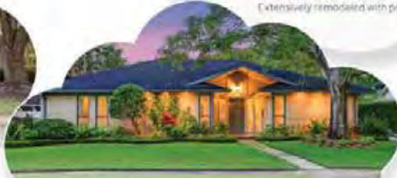
MEYERLAND | 5323 Dumfries

Offered at lot value $349,000 | ±2,697 SQ. FT. | ±10,519 SQ. FT. LOT