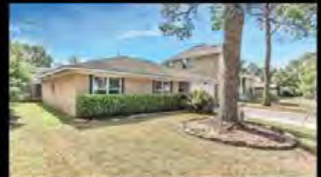
Excellent value in Meyerland area. 3/2 with large yard. $287,500