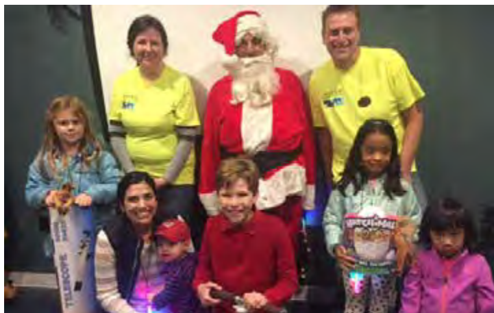
Winners of Jester Business Alliance raffle