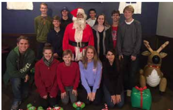
Our Amazing Volunteers!