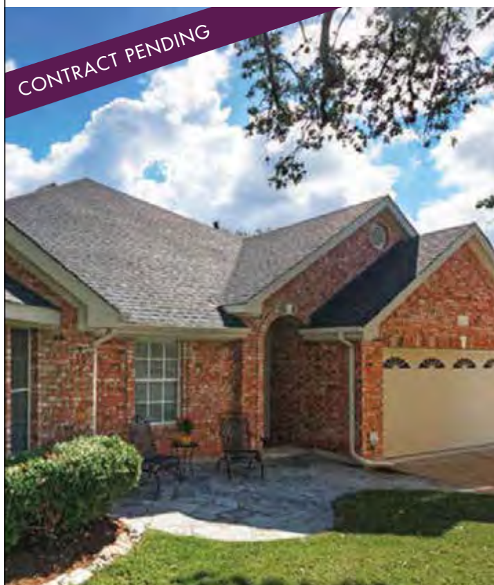
11213 SAVIN HILL LANE

SEE WHAT HOMES ARE SELLING FOR IN CIRCLE C RANCH, VISIT WWW.ASHLEYHOMEESTIMATE.COM TODAY!