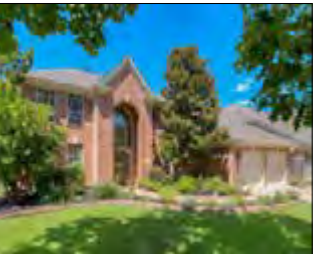
5209 Austral Loop-John's listing