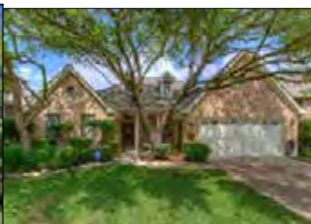
11211 Readville-John's listing