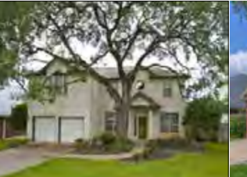
11220 South Bay-John's listing