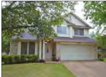
10512 Redmond-John's listing