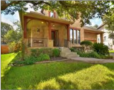
6501 Goodall Court-John's buyer