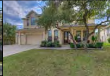
11508 Via Grande-John's listing