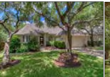
11024 South Bay-John's listing