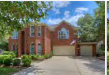
5310 Austral Loop-John's listing