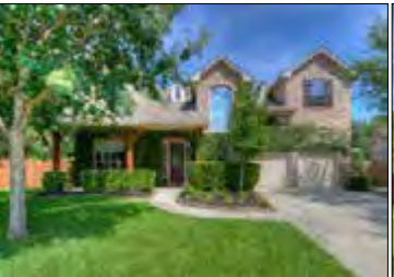
7200 Lapin Cove-John's listing