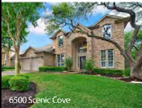
6500 Scenic Cove