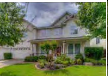
9600 Prescott-John's buyer