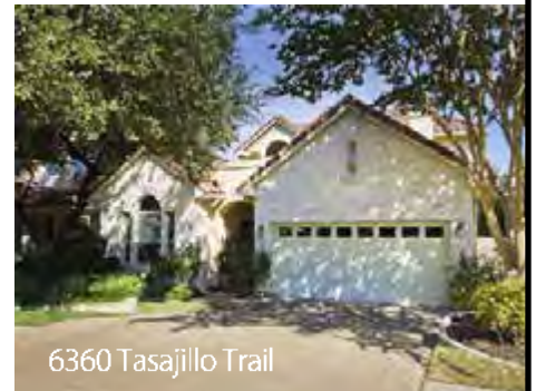
6360 Tasajillo Trail