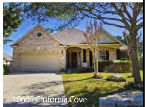
10605 California Cove