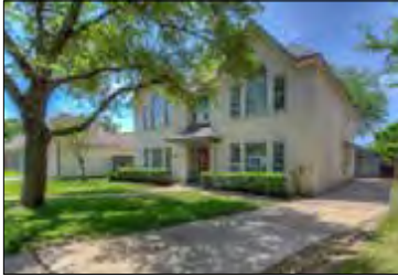
6418 Old Harbor-John's buyer