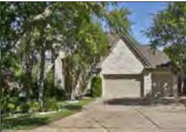
5306 Austral Loop-John's buyer