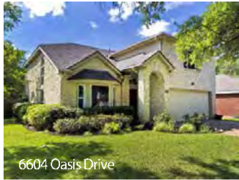
6604 Oasis Drive