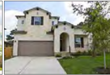
6709 Vitruvius-John's buyer