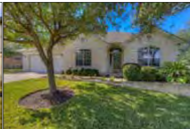
11100 Blissfield Cove-John's listing