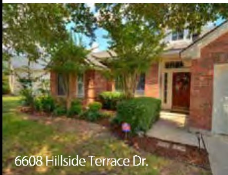
6608 Hillside Terrace Dr.