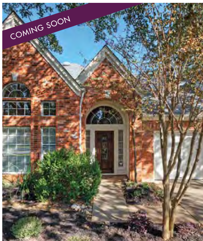
6708 EDWARDSON COVE