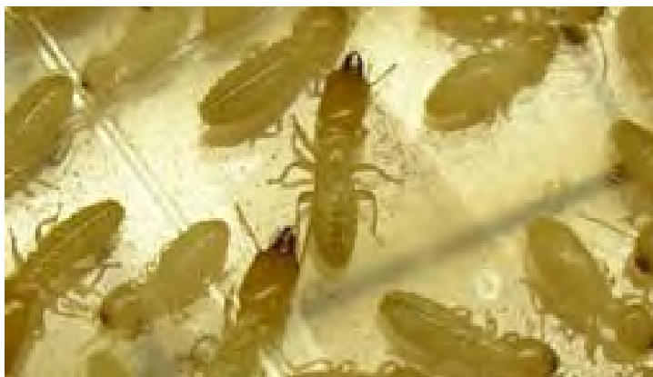
Native subterranean termite workers and soldiers.

Native subterranean termites have nests in the soil and must maintain contact with soil or an above-ground moisture source to survive. If native subterranean termites move to areas above ground they make shelter (mud) tubes of fecal material, saliva and soil to protect themselves.