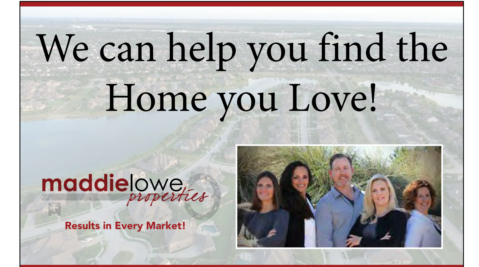
(Continued on Page 6)

Copyright © 2017 Peel, Inc. The Beacon - February 2017 5