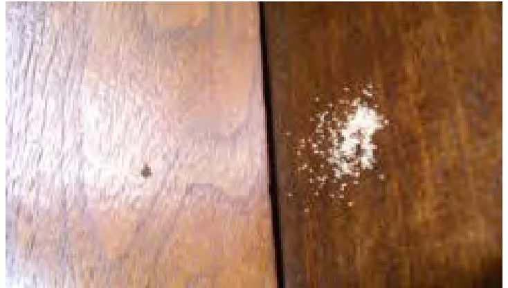
Drywood termite fecal pellets.

Drywood termites do not need contact with soil and reside in sound, dry wood. These termites obtain moisture from the wood they digest. Drywood termites create a dry fecal pellet that can be used as an identifying characteristic. They have smaller colonies-around 1,000 termites- than subterranean termites; they also do not build shelter tubes.