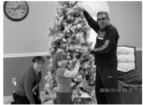
(Continued on Page 3)