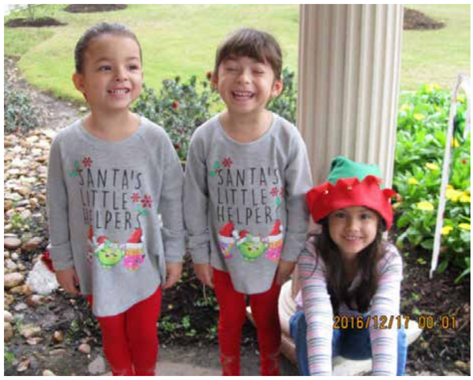
(Continued on Page 5)