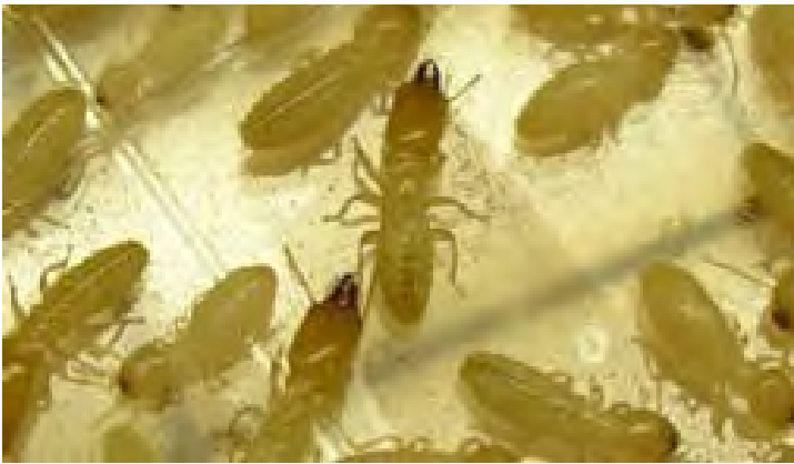
Native subterranean termite workers and soldiers.

Native subterranean termites have nests in the soil and must maintain contact with soil or an above-ground moisture source to survive. If native subterranean termites move to areas above ground they make shelter (mud) tubes of fecal material, saliva and soil to protect themselves.