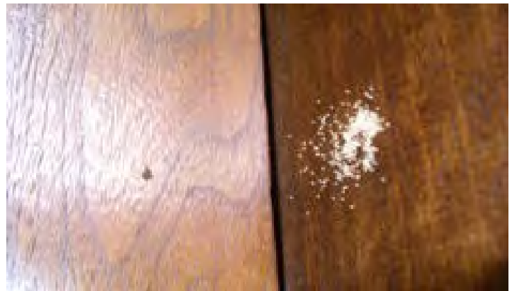
Drywood termite fecal pellets.

Drywood termites do not need contact with soil and reside in sound, dry wood. These termites obtain moisture from the wood they digest. Drywood termites create a dry fecal pellet that can be used as an identifying characteristic. They have smaller colonies- around 1,000 termites- than subterranean termites; they also do not build shelter tubes.