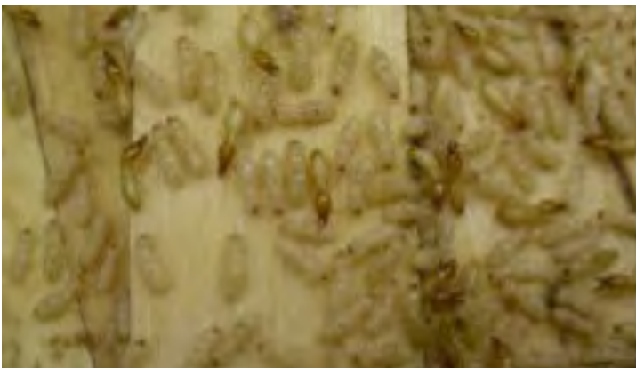
Formosan subterranean termite workers and soldiers.

Formosan termites are a more voracious type of subterranean termite. These termites have been spread throughout Texas through transport of infested material or soil. Formosan termites build carton nests that allow them to survive above ground without contact with the soil. Nests are often located in hollow spaces, such as wall voids.