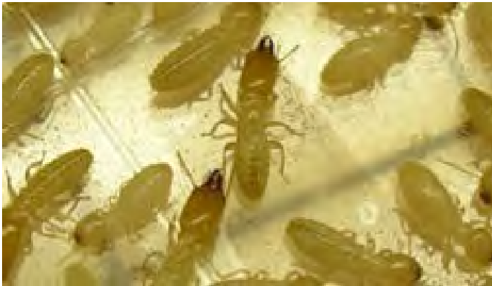
Native subterranean termite workers and soldiers.

Native subterranean termites have nests in the soil and must maintain contact with soil or an above-ground moisture source to survive. If native subterranean termites move to areas above ground they make shelter (mud) tubes of fecal material, saliva and soil to protect themselves.