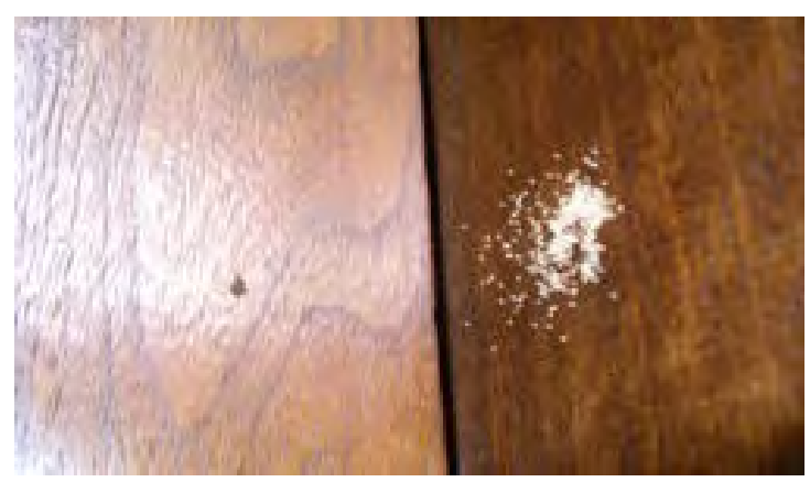
Drywood termite fecal pellets.

Drywood termites do not need contact with soil and reside in sound, dry wood. These termites obtain moisture from the wood they digest. Drywood termites create a dry fecal pellet that can be used as an identifying characteristic. They have smaller coloniesaround 1,000 termites- than subterranean termites; they also do not build shelter tubes.