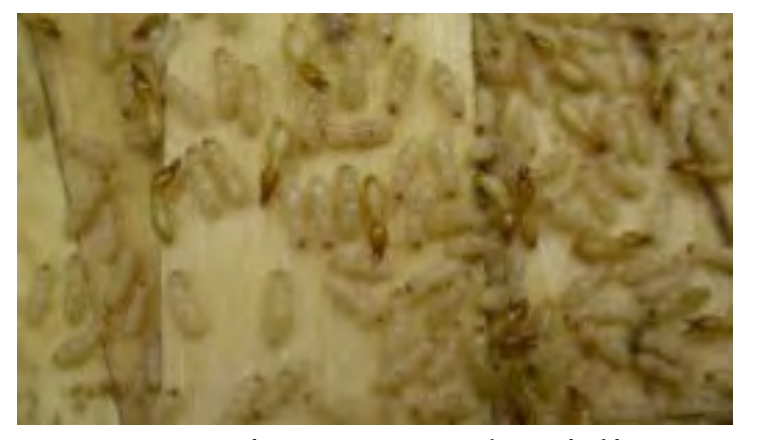
Formosan subterranean termite workers and soldiers.

Formosan termites are a more voracious type of subterranean termite. These termites have been spread throughout Texas through transport of infested material or soil. Formosan termites build carton nests that allow them to survive above ground without contact with the soil. Nests are often located in hollow spaces, such as wall voids.