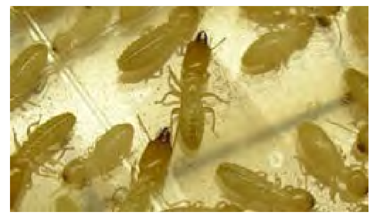
Native subterranean termite workers and soldiers.

Native subterranean termites have nests in the soil and must maintain contact with soil or an above-ground moisture source to survive. If native subterranean termites move to areas above ground they make shelter (mud) tubes of fecal material, saliva and soil to protect themselves.