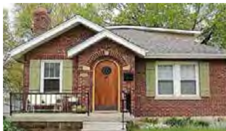
After E&H Shutters