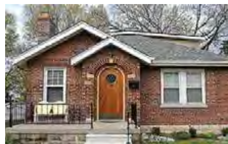
Before E&H Shutters