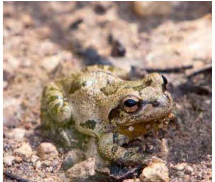
Strecker's Chorus Frog

Send your nature-related questions to: naturewatch@austin.rr.com and we'll do our best to answer them. If you enjoy reading these articles, check out our two , Nature Watch Austin & Nature Watch Big Bend, both published by Texas A&M University Press, and our blog at: naturewatchaustin.blogspot.com .