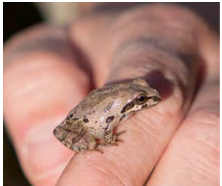
Strecker's Chorus Frog relative size.