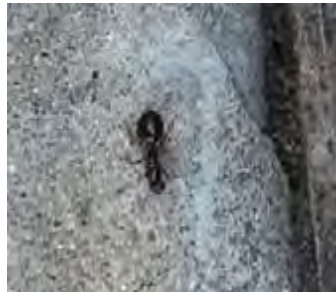
Fire ant queen without wings.

Spring time is usually when people see fire ants swarming (although it can also happen in the fall). Swarming is a reproductive process that usually occurs on warm days after a rain event. Winged males and females leave the mound and fly into the air to mate. After mating, they fall to the ground where males die and females break off their wings and search for a location to establish a new colony. Mated females dig a small chamber in soil, lay a few eggs and rear those young by themselves until the young become mature worker ants. At that point workers take