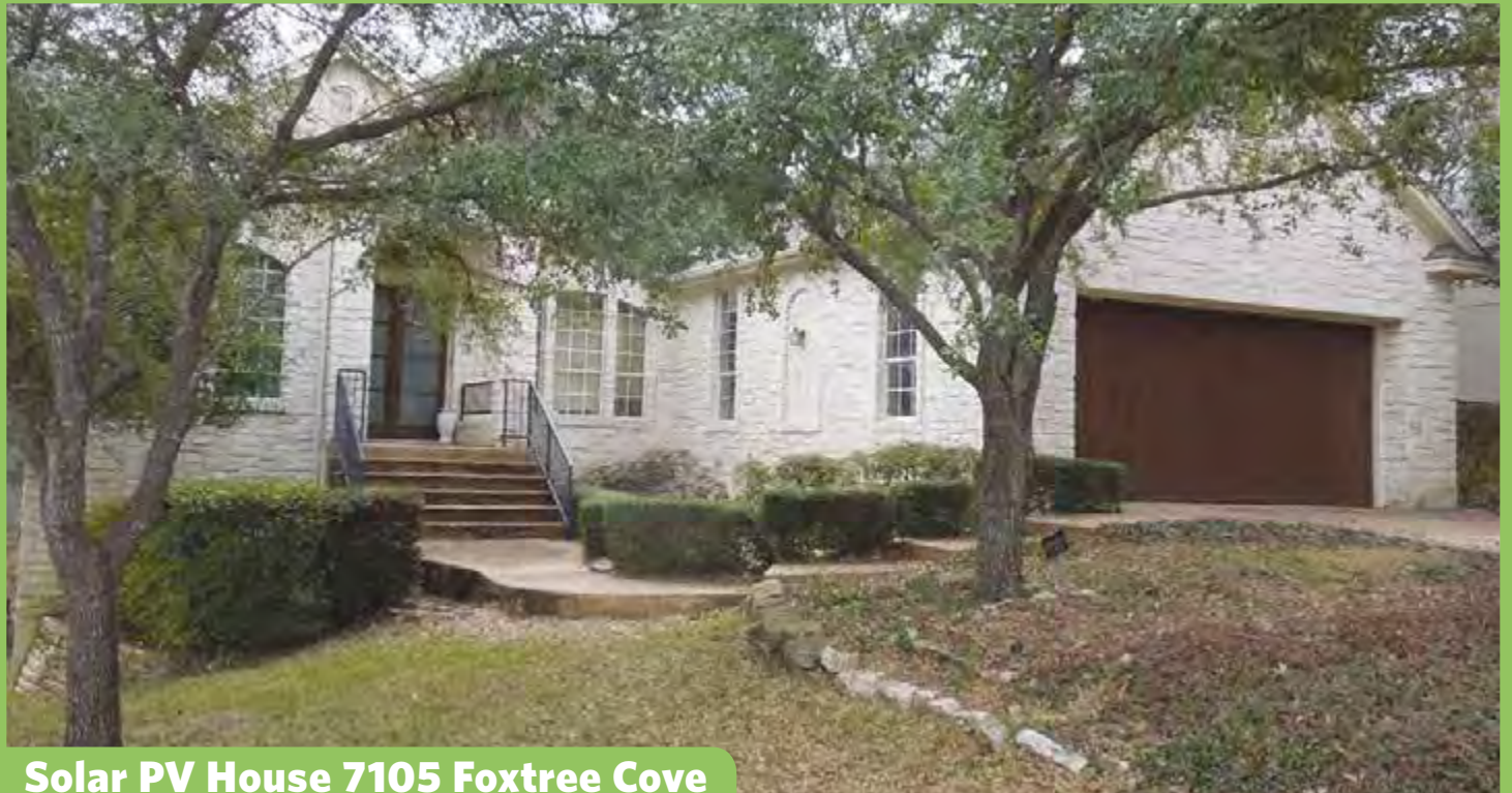
Solar PV House 7105 Foxtree Cove