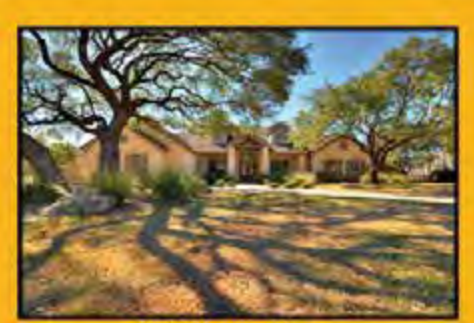
27016 Masters Plewy 3 Bed, 3 Bath, 3,311 SF $674,900