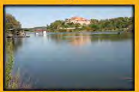
Barton Creek Lakeside 1.1 Acre Deep Cove Waterfront Lot $299,000

Ladera Avg Sales Stats 2016 Bd Ba SqFt S$SqFt Sold Price