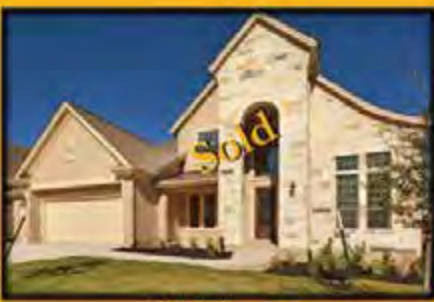
4709 Gallego Cir. 4 Bed, 4 Bath, 3,747 SF $579,900