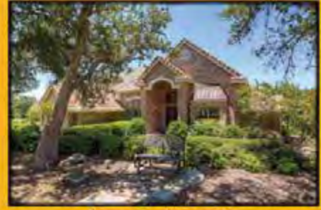
Barton Creek Lakeside 26014 Masters Pkwy $599,000