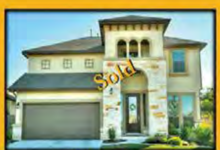
4317 Tambre Bnd. 4 Bed, 4 Bath, 2,545 SF 5424,900