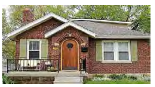
After E&H Shutters