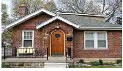
Before E&H Shutters