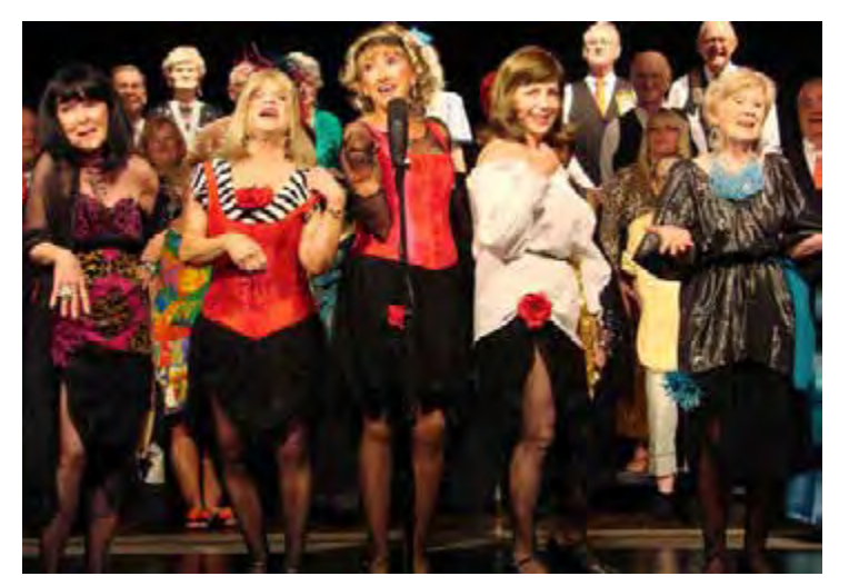
"Never on Sunday" - 2015 Spring Show