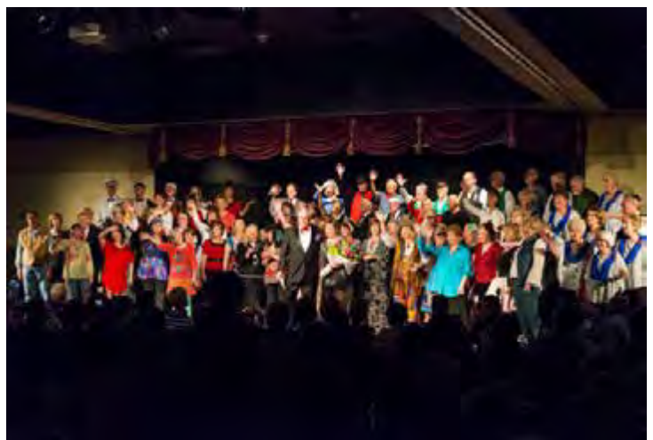
Sing Along Chorus finale – 2014 Spring Show